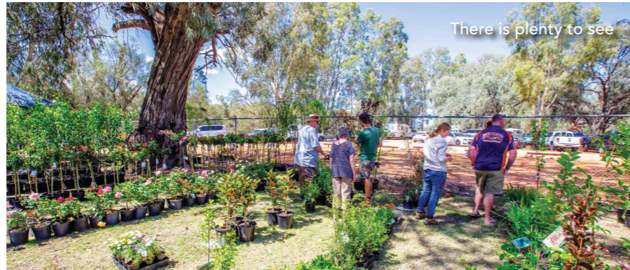
There is plenty to see

Many Australian-Italian families still gather during the winter months for salami-making days;