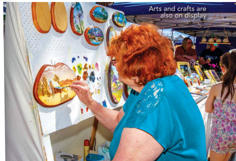
Arts and crafts are also on display