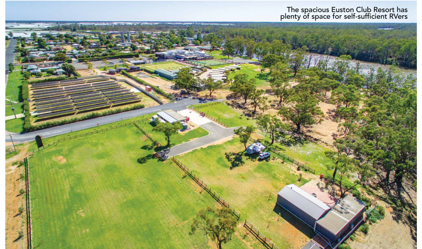
The spacious Euston Club Resort has plenty of space for self-sufficient RVers