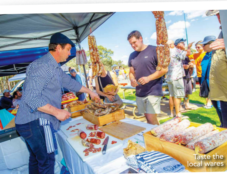
Taste the local wares

Membership is $2.20 for one year; $6.60 for three years and $11.00 for five years. With the