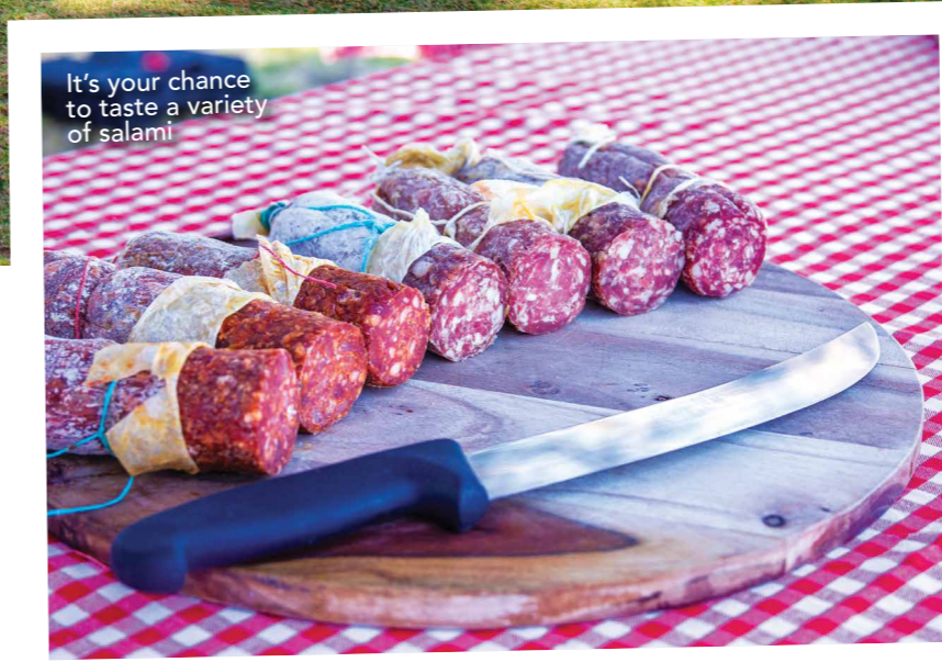
It's your chance to taste a variety of salami